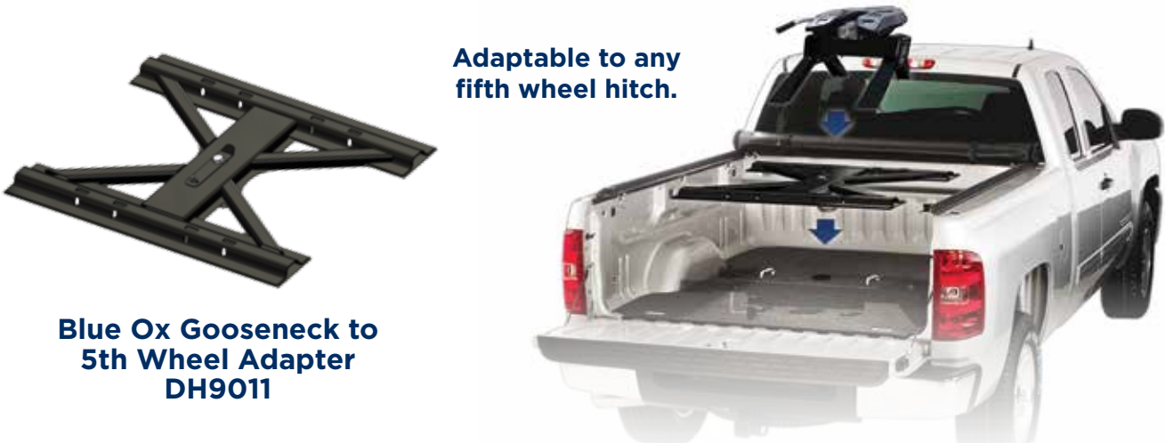
Blue Ox Gooseneck to 5th Wheel Adapter DH9011

The DH9008 converts the Blue Ox® Gooseneck to the B&W Companion® RVK3500 fifth wheel hitch. Simply drop the adapter into the Blue Ox® gooseneck socket and attach your removable fifth wheel hitch.