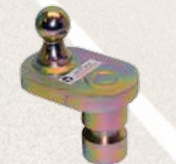
4" Offset Gooseneck Ball DH9012