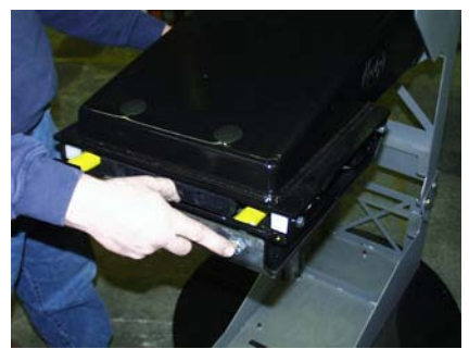
7) Put plate in location using two 9/16-12" bolts opposite corners to hold plate.