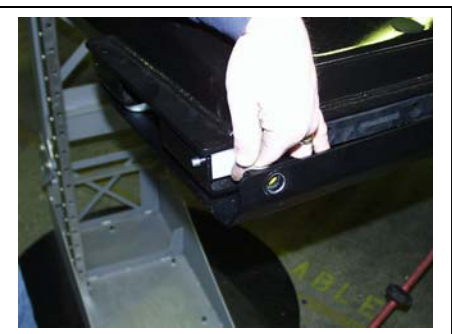
4) Install bolt through hole.