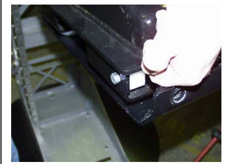
5) Install and tighten nut (self locker) x 4.