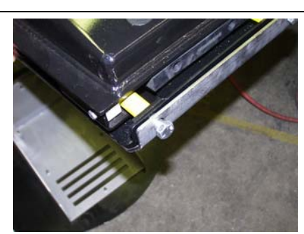
8) Align opposite corners to restraining rods.