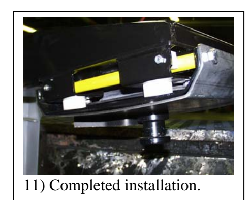
U:\RPB\Documents\RPB153-008 (Pull-rite Installation Instructions).doc