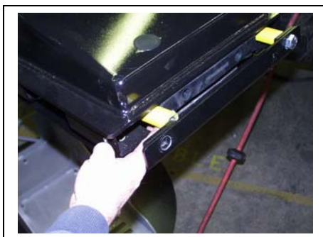
2) Push restraining rods toward center of box.