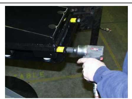
1) Remove four 9/16-12 bolts with 13/16 socket.