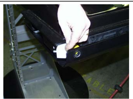
3) Slide spacer blocks into channel.