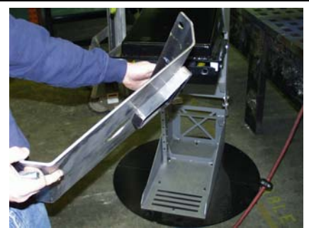
6) Slide Pull Rite skid pad (making sure wedge is to rear of box) into place.