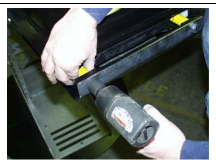
10) Tighten all 4 bolts and torque to 85 ft-lbs.