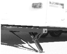
Single-Arm "C" Type Telescoping Jack