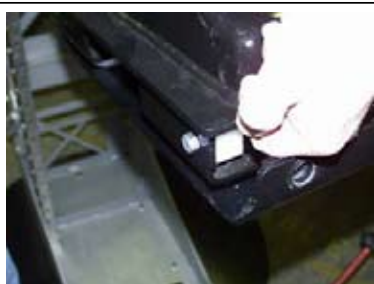
5) Install and tighten nut (self locker) x 4.