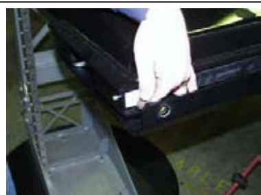
4) Install bolt through hole.