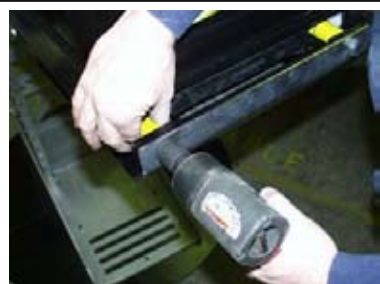
10) Tighten all 4 bolts and torque to 85 ft-lbs.