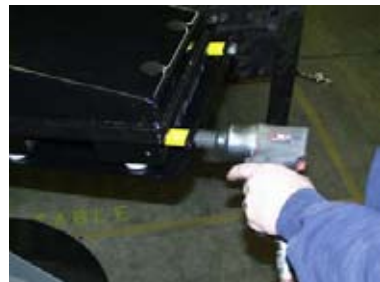
1) Remove four 9/16-12 bolts with 13/16 socket.