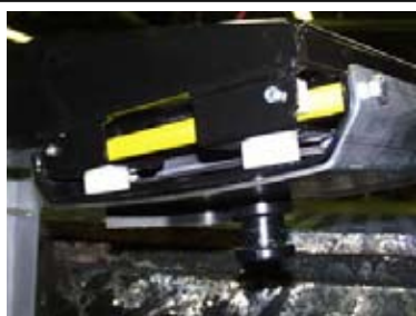
11) Completed installation.