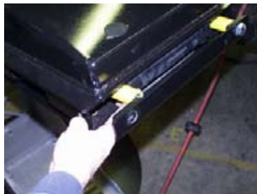
2) Push restraining rods toward center of box.