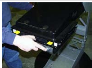
7) Put plate in location using two 9/16-12" bolts opposite corners to hold plate.