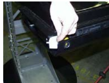
3) Slide spacer blocks into channel.