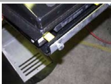
8) Align opposite corners to restraining rods.