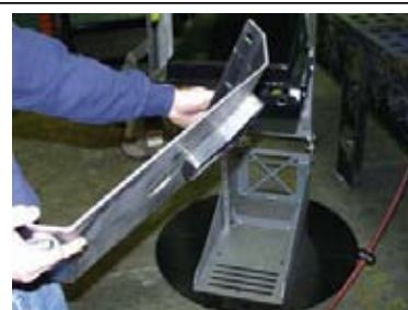
6) Slide Hijacker skid pad (making sure wedge is to rear of box) into place.