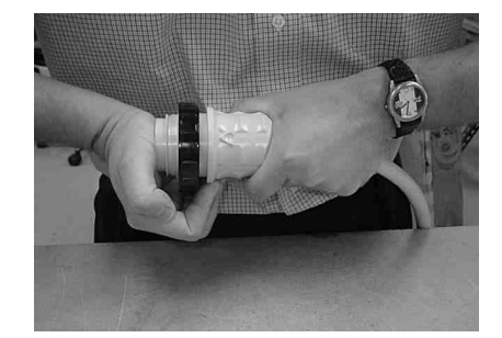
6 Be sure boot is on as far as it will go.