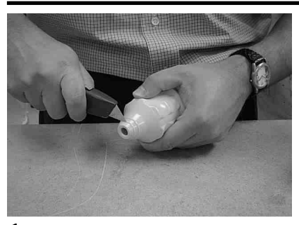
1 Cut boot at first line for cable greater than 10/3 (or greater than 5/8 in. Dia.).

IN CASE OF SALT WATER IMMERSION DISCONNECT FROM POWER SOURCE. RINSE PLUG/CONNECTOR THOROUGHLY IN FRESH WATER, SHAKE OR BLOW OUT EXCESS WATER, AND ALLOW TO DRY. SPRAY WITH MOISTURE DISPLACEMENT BEFORE RE-USE.