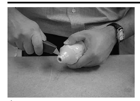
1 Cut boot at first line for cable greater than 10/3 (or greater than 5/8 in. Dia.).

IN CASE OF SALT WATER IMMERSION DISCONNECT FROM POWER SOURCE. RINSE PLUG/CONNECTOR THOROUGHLY IN FRESH WATER, SHAKE OR BLOW OUT EXCESS WATER, AND ALLOW TO DRY. SPRAY WITH MOISTURE DISPLACEMENT BEFORE RE-USE.