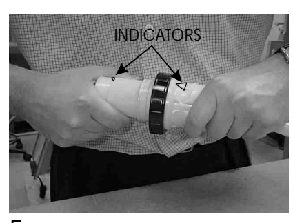
5 Align boot's triangle indicator and device's triangle indicator.