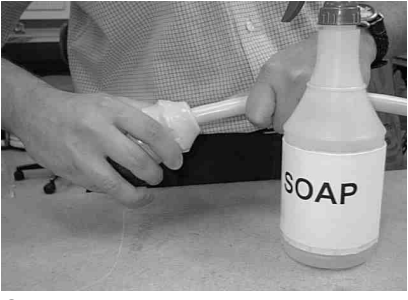
2 Apply soap solution to boot end and invert by pushing cord end against boot end. Push cord about 12 in. through boot