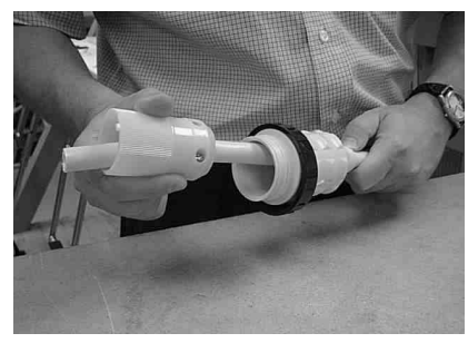
3 A tug in the opposite direction returns boot to its original shape. Before wiring, push cord through the plug/connector housing.