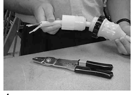
4 Strip cord and attach to device (see device's instructions).