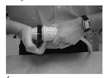
6 Be sure boot is on as far as it will go.