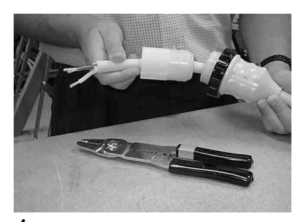
4 Strip cord and attach to device (see device's instructions).