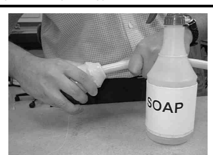
2 Apply soap solution to boot end and invert by pushing cord end against boot end. Push cord about 12 in. through boot.