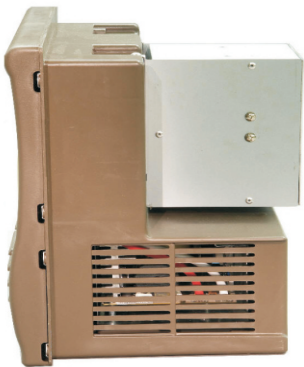
WF-8900 Series (T-30, 30A option)